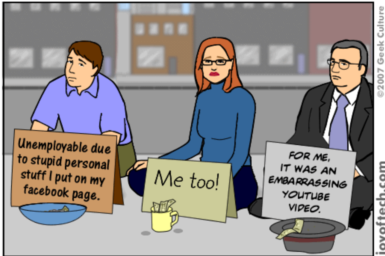
Signs of the social networking times.