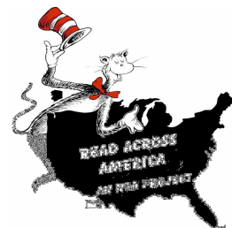
TM & © 1997 Dr. Seuss Enterprises, L.P. The Cat in the Hat. Image TM & © 2007 Dr. Seuss Enterprises, L.P. All Rights Reserved.

Plan now to celebrate "Read Across America" on March 2, 2007