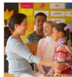
NATIONAL TEACHER DAY (Great Teachers Make Great Public Schools)