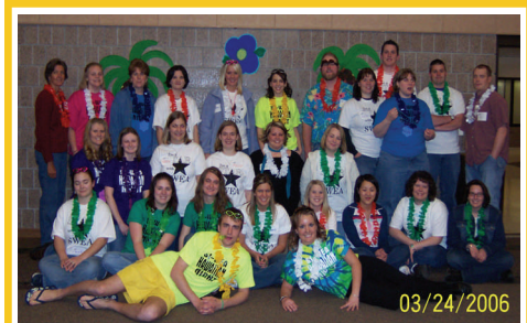
UW-Stout's members at Hawaiian night!

Beloit College *affiliated with Student WEA in April