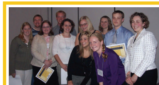
Student WEA state award winners!

Each year chapters have the opportunity to apply for various awards to recognize the hard work they put throughout the year. Although there is only one first place, simply by applying for each and every award, one honors and recognizes the value and hard work of the leaders and members in each chapter organization. With that in mind, I would like to take a moment to congratulate all of our chapters for all of the great things that are continuously being done to strengthen the organization, members, and public schools.