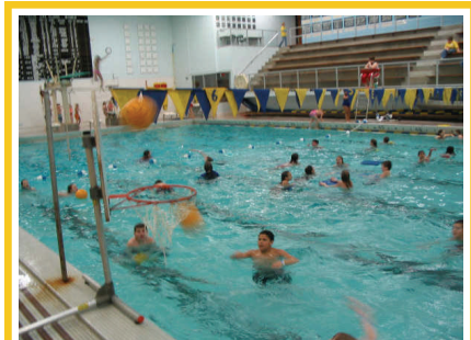
UW-Eau Claire's grant project-the lock-in!