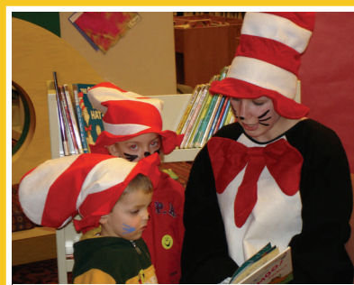
UW-Oshkosh's Read Across America celebration!