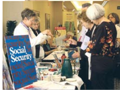
Left: Participants browsed the exhibits between sessions.