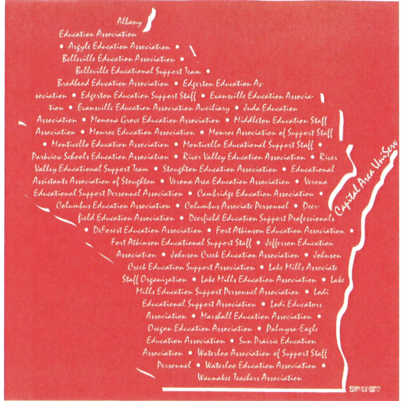
Back of Shirt (T-Shirts only)

Size: SM ___ M ___ L ___ XL ___ XXL ___ 3XL ___ 4 XL ___ 5XL ___